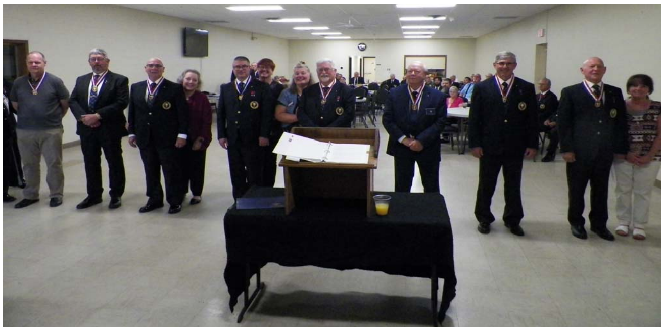
Faithful Navigators and Ladies, Grand Rapids Assembly Officers Installation at Bishop Haas Hall