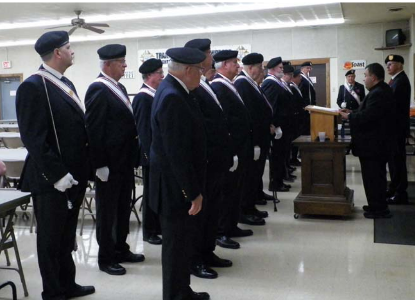
Honor Guard and Faithful Navigators Saginaw Assembly Officer Installation Fr Van Rooy Council #2740 Hall, Essexville Sunday, September 11, 202